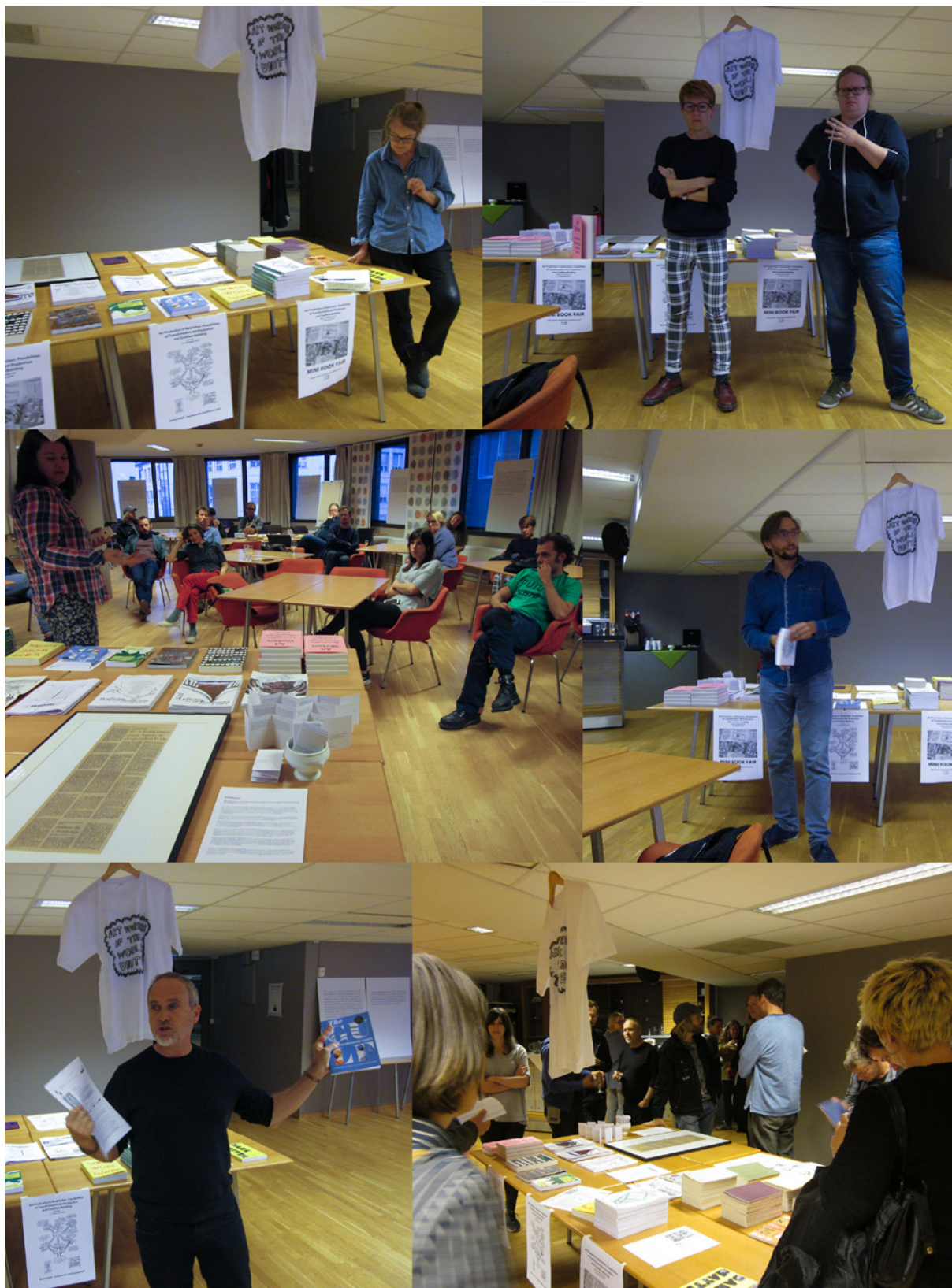
Mini Book Fair, Trondheim Seminar, September 2015