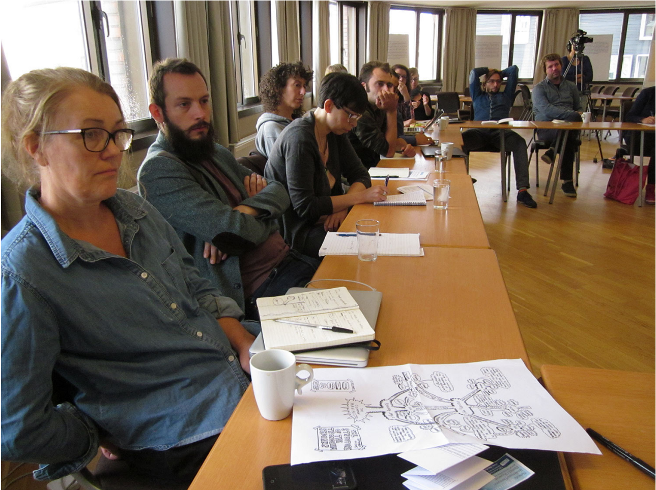
Plenary session, Trondheim Seminar, September 2015

unification and cohesion certain concepts presuppose and what their implications for coalition-building are. There were two aspects looked into, from where artistic labor can be grabbed, the concept of productive and unproductive labor , and the concept of division of labor .