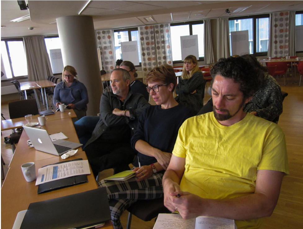
Plenary session, Trondheim Seminar, September 2015

contexts. This means that existing organizations need to develop the capacity to reformulate their problems, demands and political strategies keeping in mind a trans-local approach.