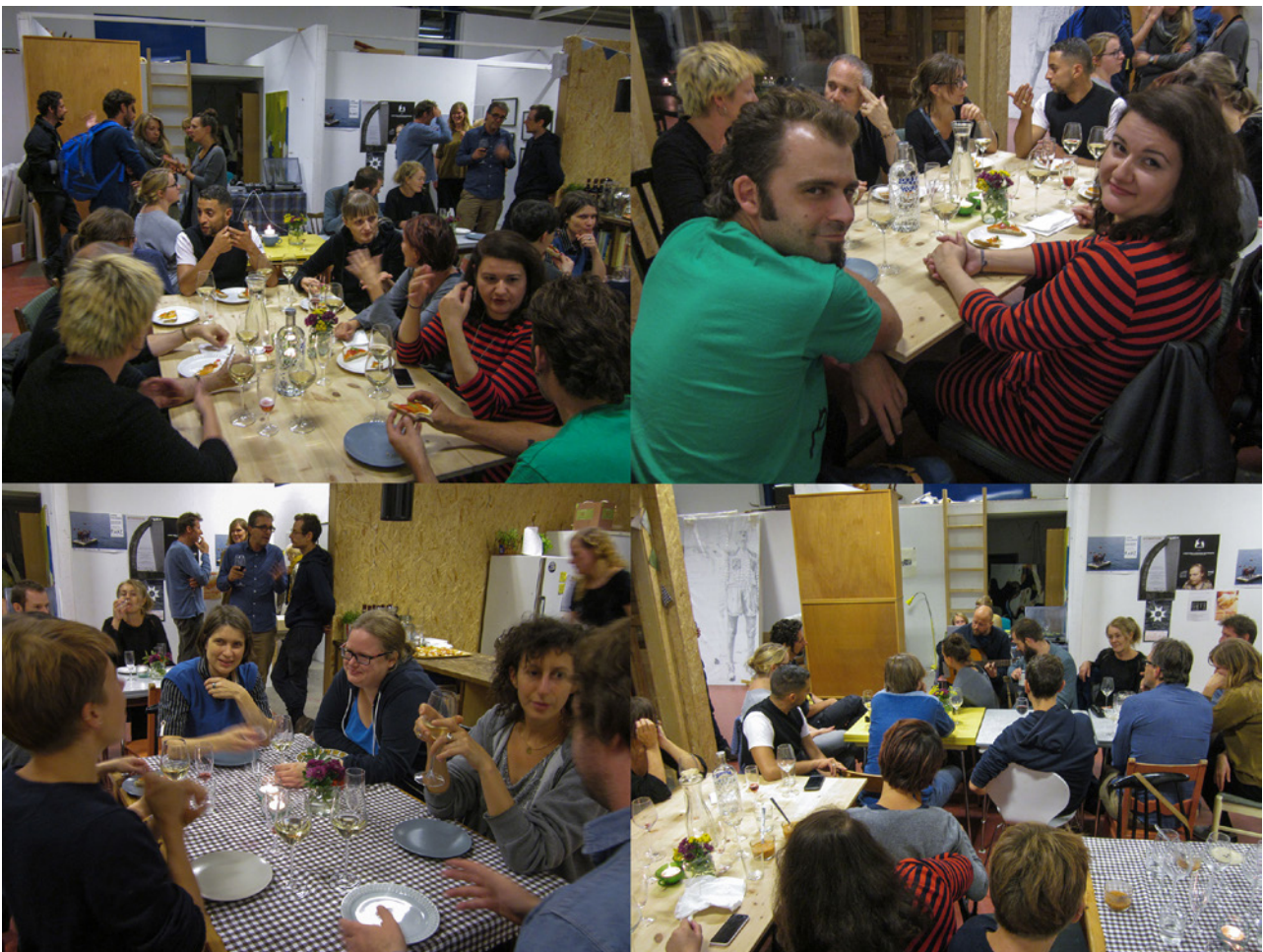
Dinner at RAKE workspace, Trondheim Seminar, September 2015

In the beginning it was stated that the group speaks from the position of artists and cultural workers. The group stressed that the emancipatory force of art can only be realized if art doesn't exploit people in the interest of art but if art puts itself in the