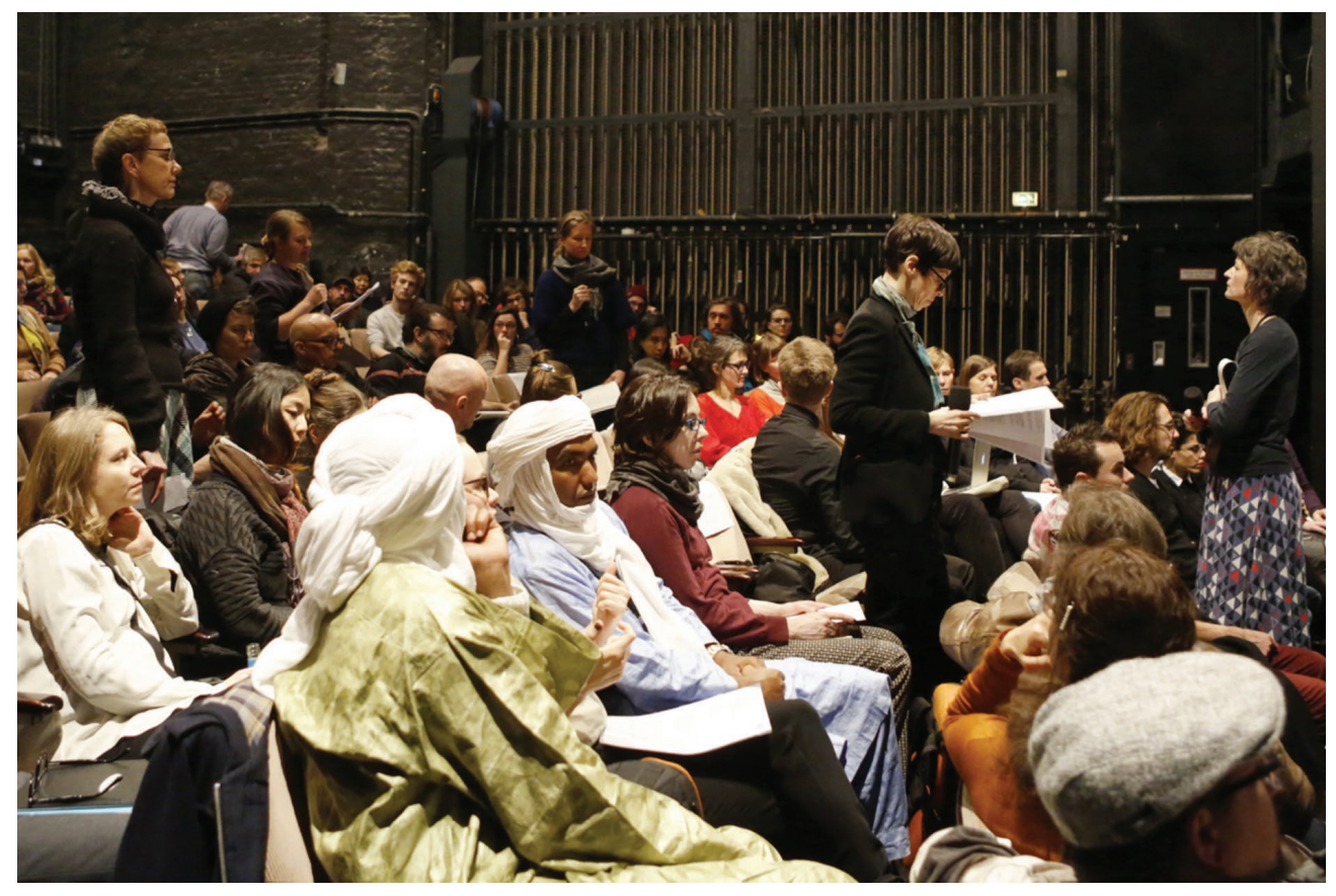
Haben und Brauchen, performing at HAU, 2015.

Our wish to work equally in groups implicates the resistance to a logic of selection, a selective determination of single representatives, like the most souvereign person, the most eloquent speaker, the most well-known person, the male offensive speaker. What degree of trust and reliance do we need to encourage each other? Which needs do we want to articulate publicly? How can we negotiate within our group how to follow invitations sent out to single individuals? How can we pled to work as a group in contexts like this? Who decides who will be a representative?