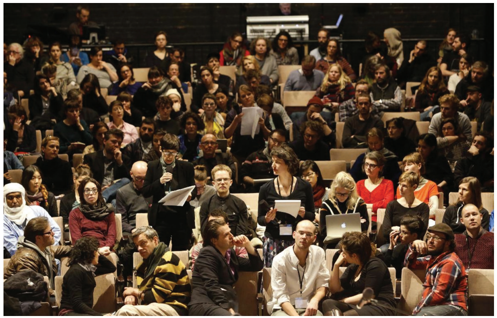
Haben und Brauchen, performing the statement a HAU, 2015.

With this letter to Have and to Need positioned itself against the exhibition project 'Based in Berlin' which was initiated by the former mayor Wowereit. To Have and to Need protested against the instrumentalization of artists for neoliberal image policy and city marketing. To Have and to Need demands cultural policy that adequately responds to the specific needs of the thousands of artists living and working in this city and their institutions.