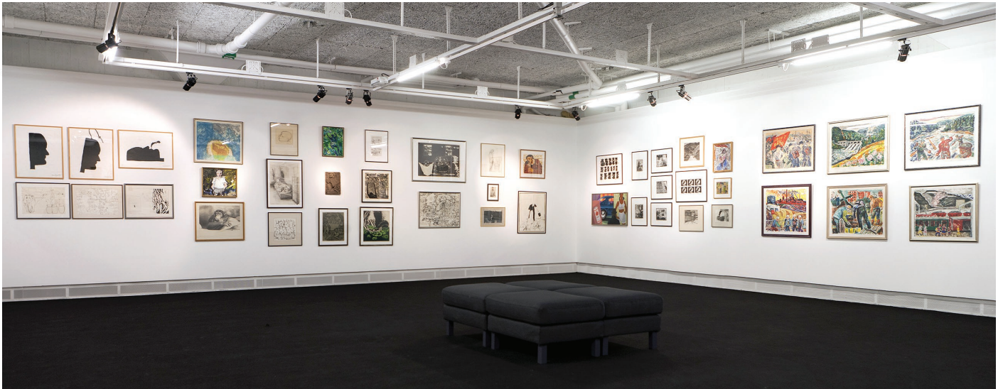
"The Miners' Strike Art Collection" (at Gällivare museum), Tensta Konsthall, Stockholm.

from various cultural fields stepped up to support the strike and thus promote a more equal society. Curators were putting solidarity posters up publicly. Theatre companies put up plays in the mining district and filmmakers documented the course of the strike on site. Artists and musicians organized petitions and collections for the strikers in Stockholm; at cultural institutions experimental activities were established to capture the new social and political movements.