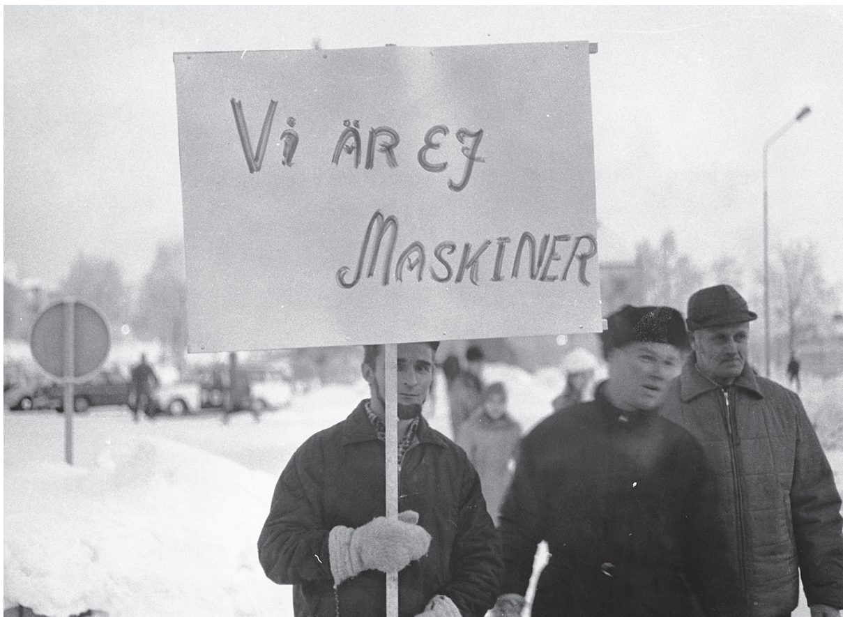
"We are no machines", Photo: Press TT.

The miners' strike received broad popular support. Many political groups visited the ore fields during the strike: sociologists, journalists, activists and cultural workers.