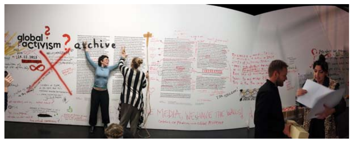
"Wall Chatting" intervention: at the "activist summit of the ZKM exhibition "Global Activism," January 2014.

is a social relation. Personal debt churns in the "dark matter" of the invisible part of the art world, circulating as lifelong relationships to banks which greatly modifies daily life, creating a constant power imbalance. This can be seen from the micro to macro scale. Like many US based artists, I am deeply in debt for my masters degree, and in early 2013 inspired by Strike Debt's Rolling Jubilee, I began to model an exchange system that tie the value of art objects to the debt of their creator, aiming to