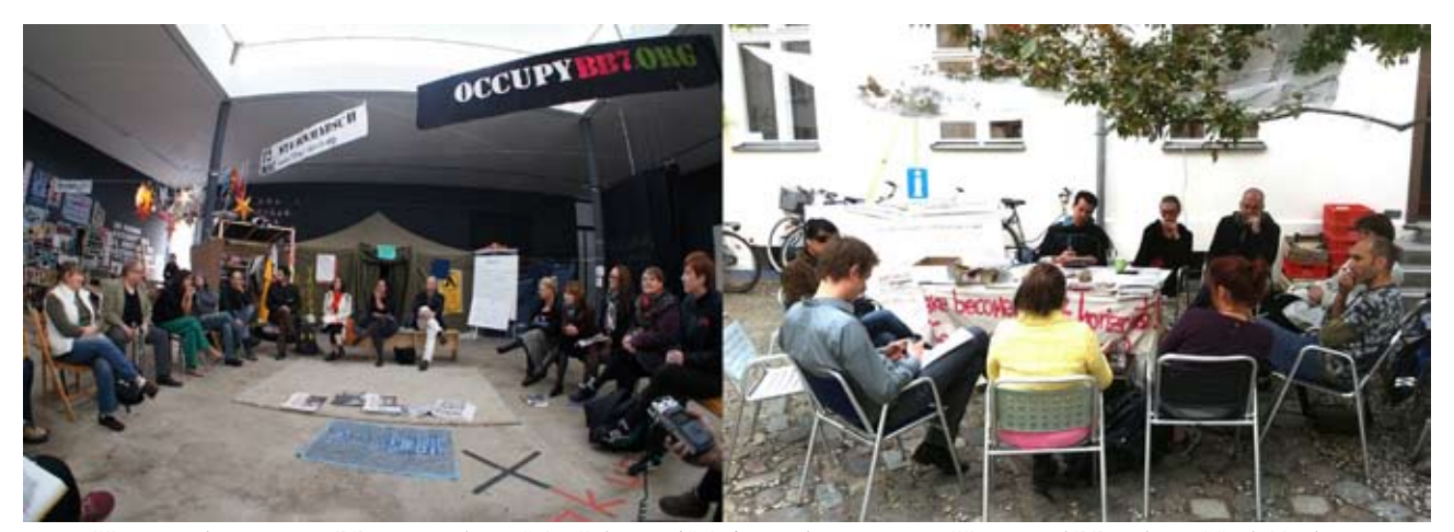
Horizontal meeting at BB7 2012 Media working group at Horizontal BB7