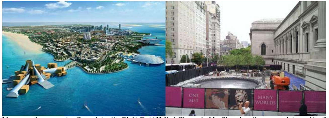
Museums under construction: Guggenheim Abu Dhabi, David H. Koch Plaza at the Met

ing the public space covered over by the private sphere. And finally, I realized that our post-occupy network in its energetic visual pulsing and dense communication structure and collective memory had become a sort of machine for propagating a new culture. So I propose to think of this entity not as a protest called "Occupy Museums" but as an institution: the Occupied Museum.