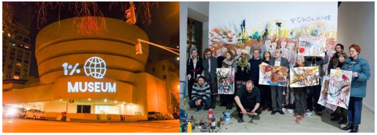
Global Ultra Luxury Faction (G.U.L.F): March 2014 action: "Rebranding Guggenheim" with OWS illuminator. / Winter Holiday Camp: members and staff with "Diplomas."

This text is informed by individual and collective practice—particularly since the Occupy Wall Street Movement of September 2011. I hope its assumed that the groups discussed here: Occupy Museums, Horizontal BB7, Debtfair, Winter Holiday Camp, and Global Ultra Luxury Faction (G.U.L.F) contain divergent views. Here I share my pathways with them and through them, and my vision of our horizon.